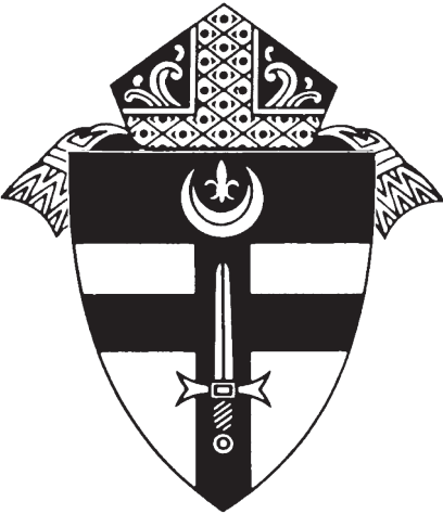
DIOCESSE OF COVINGTON